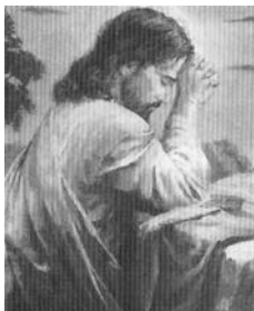
My soul is sorrowful even unto death. Stay here and watch. (St. Mark XIV-34)

O Jesus, through the abundance of Thy love, and in order to overcome our hardheartedness, Thou pourest out torrents of Thy graces over those who reflect on Thy most sacred sorrow in the Garden of Gethsemane, and who spread devotion to it. I pray Thee, move my soul and my heart to think often, at least once a day, of Thy most bitter Agony in the Garden of Gethsemane, in order to communicate with Thee and to be united with Thee as closely as possible.